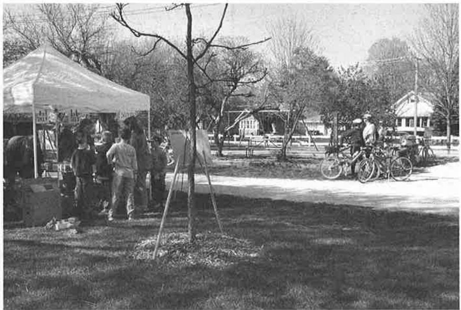
The Wheaton Environmental Improvement Commission's tent will be the hub of this year's Wheaton area cleanup activity.