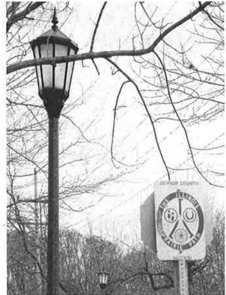
This and other lamps will light the Lombard section beginning this summer

The new lights span east from Rt. 53 to the Village's eastern border near Addison Ave.