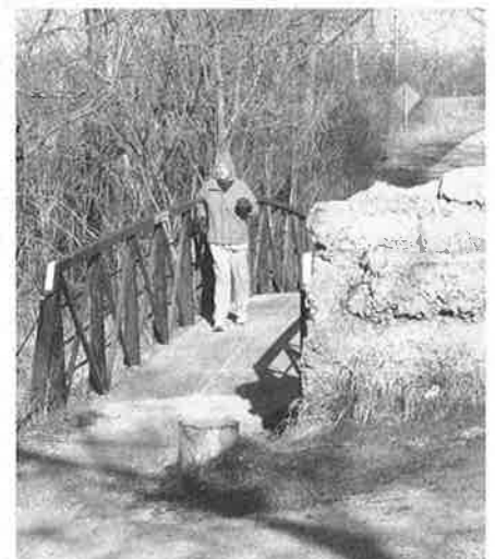
A Path user jogs over the East Branch bridge in late winter

at www.dupageco.org/bikeways under Illinois Prairie Path and Great Western Trail.